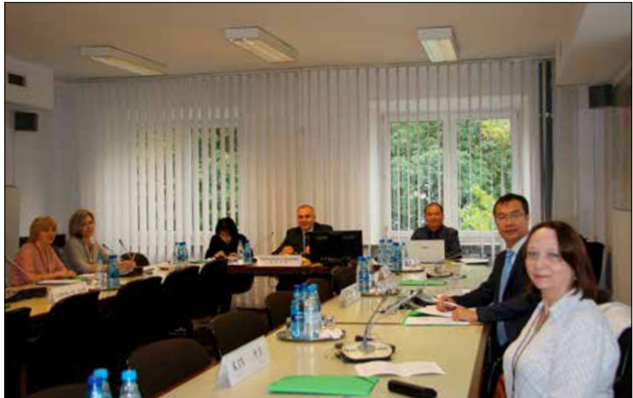
Meeting of the OSJD railway experts on the subject "Systems for reservation of seats, reference and information services for passengers, provision of services and generation of financial reporting" (26-27.09.2023, OSJD Committee)

But for non-regular customers, among whom the share of users of the KorailTalk mobile application is low, the company launched sales and ticketing services on external platforms such as NAVER and KAKAO, the majority of whose users are constantly online. This uses API technology, an application program interface that provides access to the data platform for