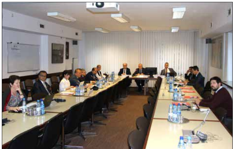
Final meeting of the OSJD Commission on Passenger Traffic (24-26.10.2023, OSJD Committee, in a hybrid mode)