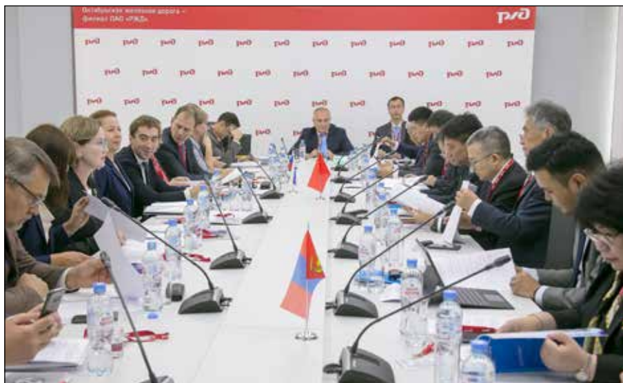
Opening of the meeting of group 2 of OSJD railways for the development and coordination of passenger train timetables, coach sequence indicators for the formation of trains and the provision of coaches in them in international traffic for 2023-2024 (11-15.09.2023, St. Petersburg, Russian Federation)

According to the Byelorussian Railway , the railway administration currently provides the ability for ticket cashiers to issue travel documents (tickets) for trains of interregional lines and regional business class lines (with numbered seats) using stationary ticket printing machines. Since September 2023, the upgraded software for portable ticket printing machines has also been put into trial operation in terms of issuing travel documents (tickets) to passengers by the train master. In this case, the travel documents are printed on thermal tape without