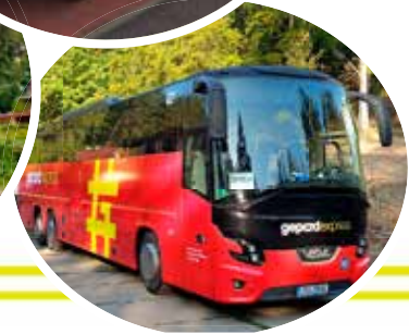
Background of Gepard Express (an OSJD affiliated enterprise)

Within the framework of the subject “ Improving the Agreement on the ‘Rules for the use of passenger coaches in international traffic’ (PPW Agreement) and the PPW Rules”, a meeting was held in the OSJD Committee from 31 May through 2 June 2023 of the representatives of the OSJD railways – Parties to the PPW Agreement attended by the representatives from BC, KZH, KZD, KRG, LDZ, CFM, UBZD, RZD OJSC, TDZ, UTI and EVR.