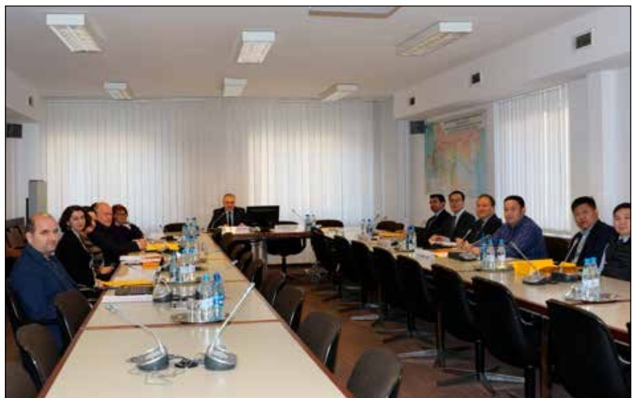
Meeting of the OSJD railway experts on the subject “Systems for reservation of seats, reference and information services for passengers, provision of services and generation of financial reporting” (28.02-01.03.2023, OSJD Committee)

Due to numerous requests from passengers on the official website bilet.railways.kz , as well as in the mobile application, the ability to obtain a boarding pass for completed trips has been implemented. If it is necessary to confirm the fact of travel (in terms of business trips, reimbursement of expenses, legal proceedings, etc.), holders of electronic tickets, having registered boarding by the train conductor, can receive