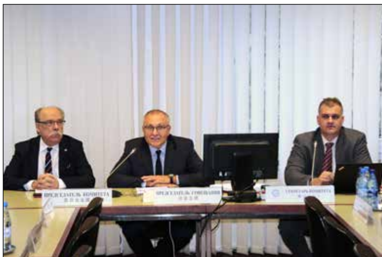
Presidium of the final meeting of the OSJD Commission on Passenger Traffic (24-26.10.2023, OSJD Committee, in a hybrid mode)

In the traffic between China and Russia in the timetable for 2023-2024, it is planned to run train No. 20/19 formed by the FPC JSC on the route Moscow – Beijing, as well as a group of direct coaches on the route Chita – Manchuria through the border crossing Zabai-