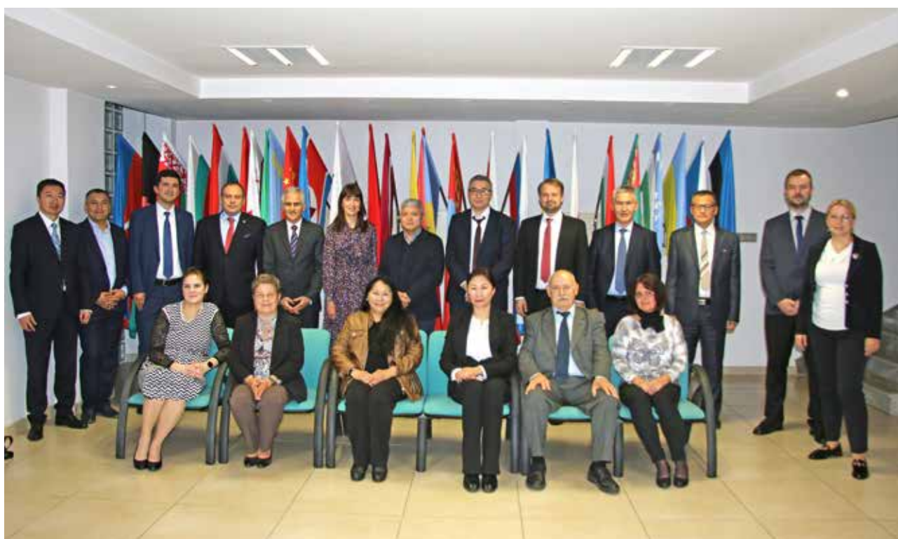
Participants in the final meeting of the OSJD Commission on Freight Traffic (10-13.10.2023, OSJD Committee, Warsaw)

In order to increase freight traffic volumes, the "KTZ NC" JSC (KZH) actively cooperates with the railway administrations of Iran, Russia and Turkmenistan. Together with the railway administrations involved, the railway infrastructure has been analysed. In addition, in order to increase competitiveness, competitive tariffs for the transport of goods in containers and wagons have been developed jointly with the railway administrations.