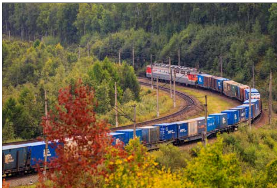
The number of regular container train routes is increasing with every passing year

The Parties to the PGW Agreement – participants in the meeting also considered the proposals received from the Parties to the PGW Agreement – MAV Co. and RCH Co. on amendments to the PGW Agreement regarding identification of freight wagons, as a result of which it was decided that proposals should be discussed at the meeting of authorised representatives to supplement paragraph 3 “General conditions for the use of wagons” of Appendix B to the PGW Agreement with a new sub-item in terms of requirements for identification of freight wagons and inscriptions on the wagon, as well as to supplement sub-item 16. 2, paragraph 16, “General Provisions” of Appendix B to the PGW Agreement with a provision on the procedure for informing in case of a change in the status of a joint-use freight wagon.