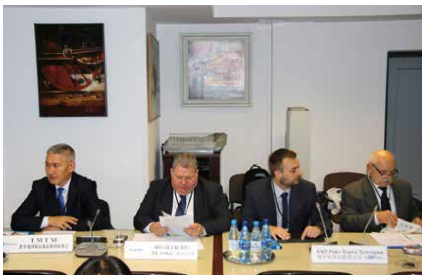
Representatives of OSJD affiliated enterprises and TITR at the final meeting of the OSJD Commission on Freight Traffic (10-13.10.2023, OSJD Committee, Warsaw)