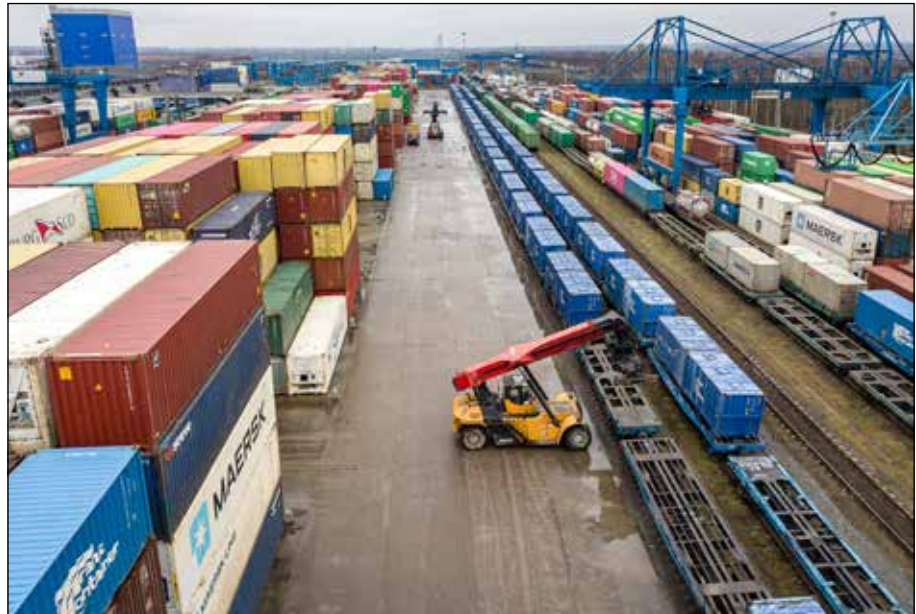
Container transportation plays a special role in the development of transport logistics, being the most reliable and efficient way for the transportation of goods