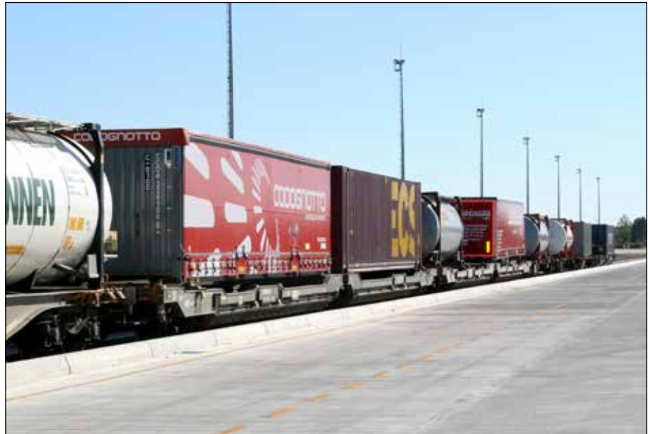
Con trailer and multimodal transportation is becoming increasingly developed in the segment of international freight traffic

The subject “ A study of terminology used in combined, intermodal, and multimodal transport operations (TCIMT) ” is examined