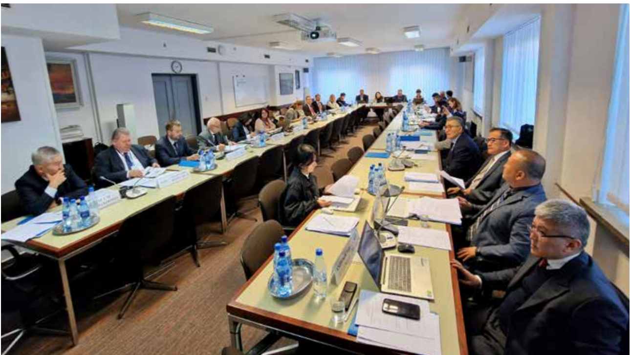
During the discussion of the agenda items of the final meeting of the OSJD Commission on Freight Traffic (10-13.10.2023, OSJD Committee, Warsaw)

It was agreed to include into the draft Work Plan of the OSJD Commission for 2024 the