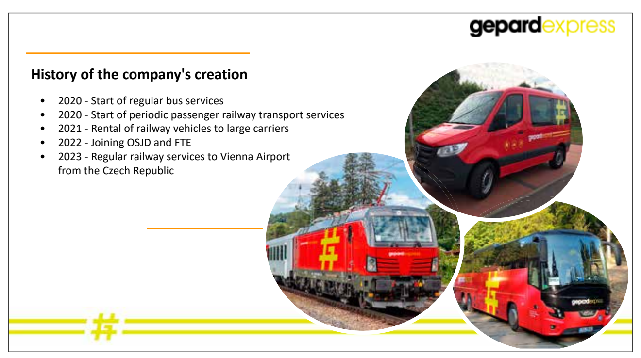
Background of Gepard Expres (an OSJD affiliated enterprise)

Within the framework of the subject "Improving the Agreement on the 'Rules for the use of passenger coaches in international traffic' (PPW Agreement) and the PPW Rules", a meeting was held in the OSJD Committee from 31 May through 2 June 2023 of the representatives of the OSJD railways – Parties to the PPW Agreement attended by the representatives from BC, KZH, KZD, KRG, LDZ, CFM, UBZD, RZD OJSC, TDZ, UTI and EVR.